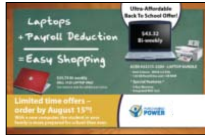
Back-to-School ...July 15 – August 15