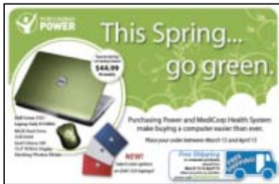
Spring ...March 15 – April 15

Purchasing Power is communicated three times a year