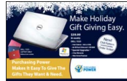
Holiday ...November 15 – December 15

A variety of communication vehicles are used